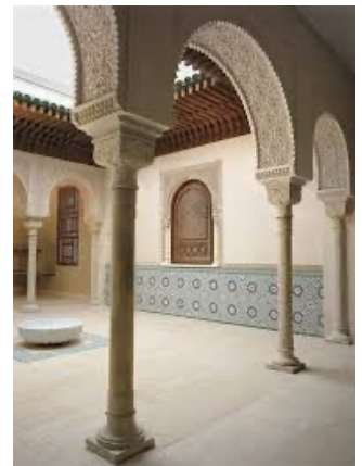
The Moroccan Court at The Met.

Navina Najat Haidar is the Nasser Sabah al-Ahmad al-Sabah Curator in Charge of the Department of Islamic Art at the Metropolitan Museum of Art in New York.