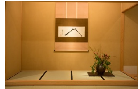
Tokonoma.